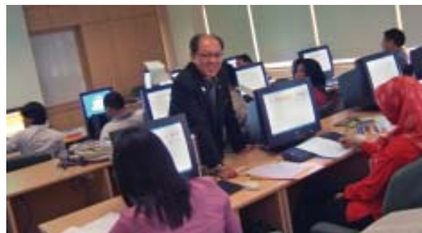
Come for a hands-on session at the Training Room in Central Library